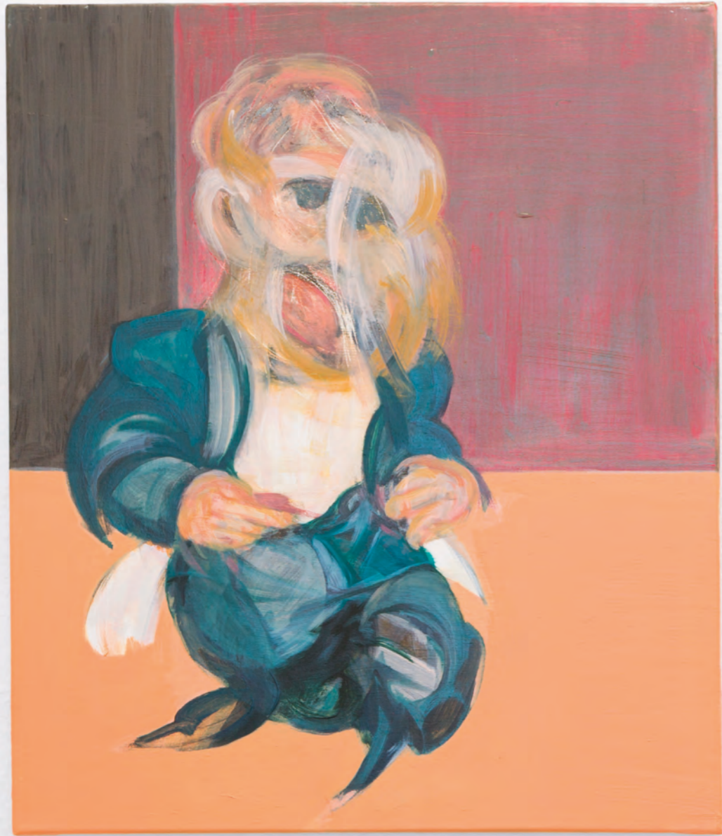
FIGURE IN A ROOM 70 x 60 cm oil on canvas