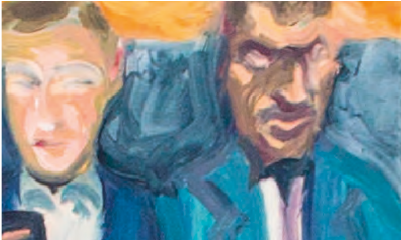
TWO FIGURES, SEATED detail