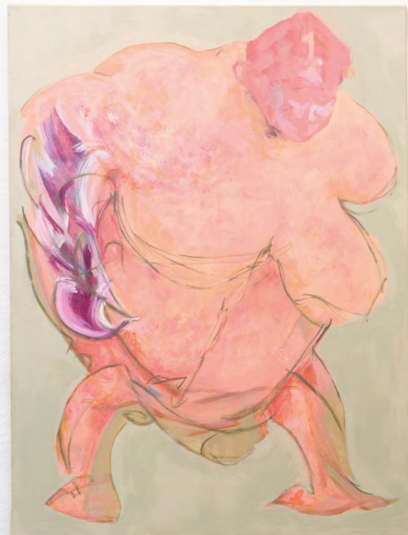
STUDY FOR THE WISDOM OF SILENUS #2 120 x 90 cm oil on canvas