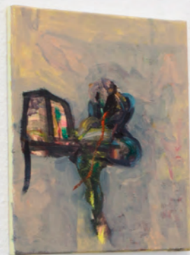
FIGURE, SEATED (left wall) 40 x 30 cm oil on canvas