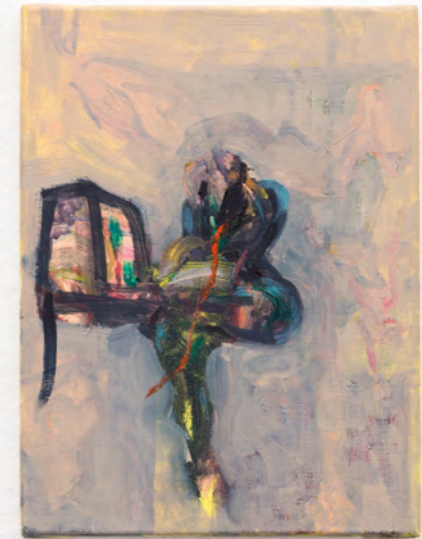
FIGURE, SEATED 40 x 30 cm oil on canvas