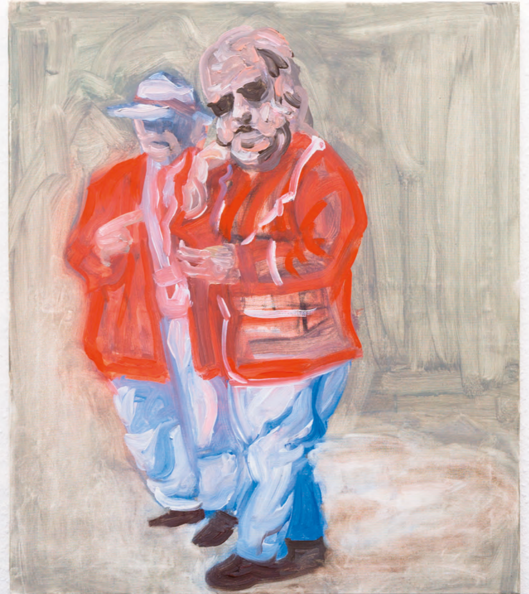
TWO FIGURES IN RED AND BLUE 70 x 60 cm oil on canvas