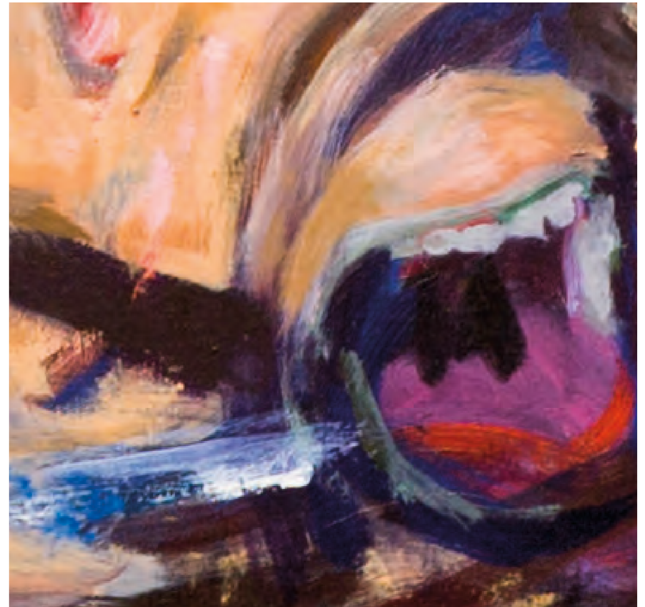
THREE STUDIES OF A MOUTH (triptych, centre panel) detail

previous page: THREE STUDIES OF A MOUTH (triptych) 80 x 60 cm each oil on canvas