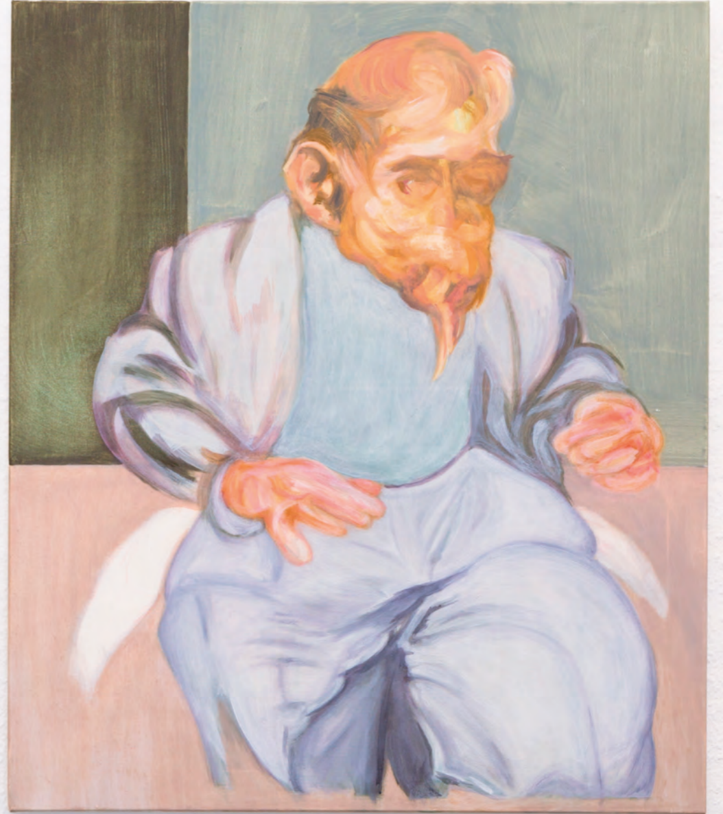
FIGURE, WALKING IN A ROOM 70 x 60 cm oil on canvas