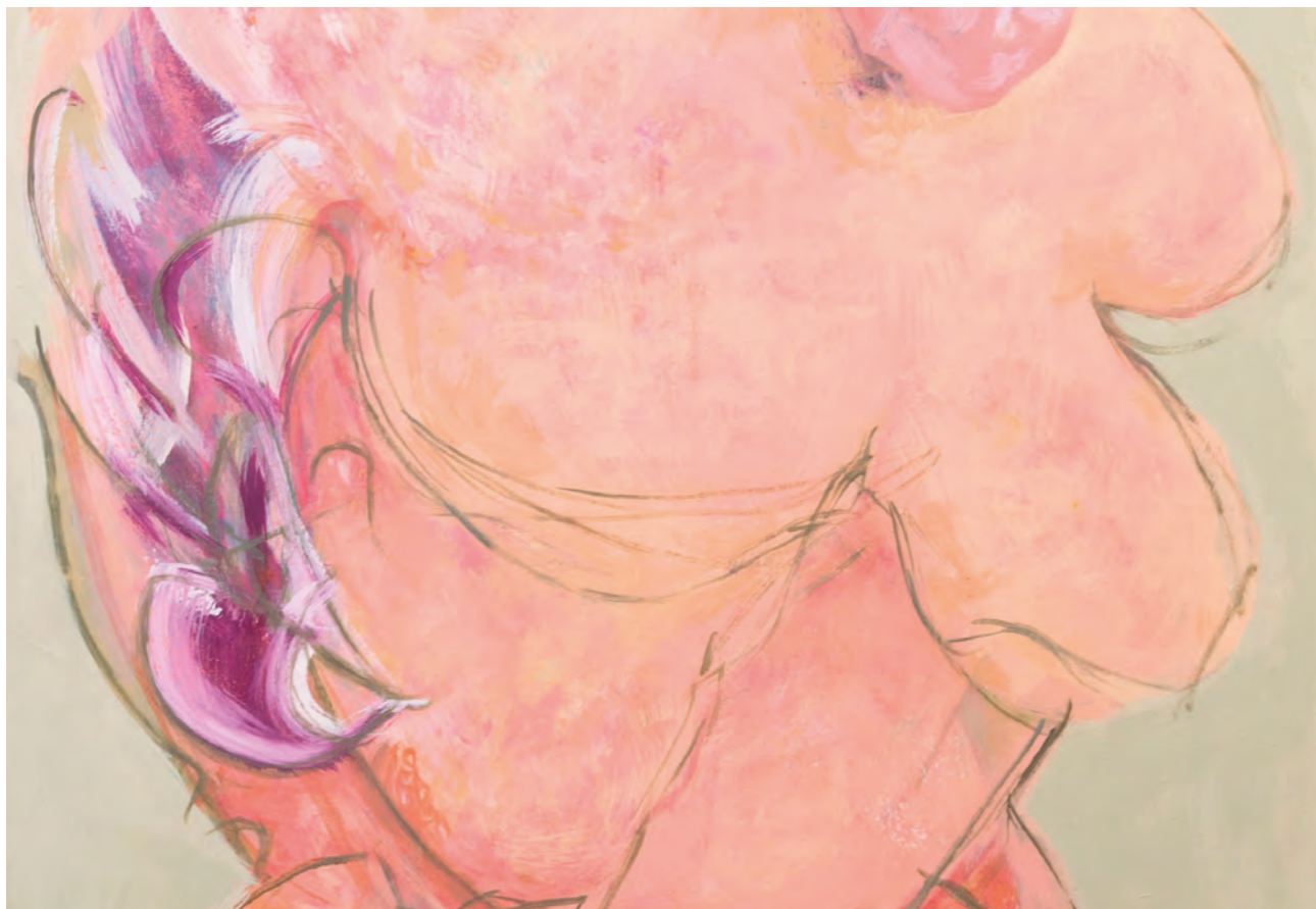
STUDY FOR THE WISDOM OF SILENUS #2 detail