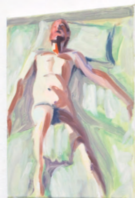
FIGURE ON BED 40 x 30 cm oil on canvas