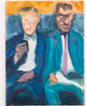
INTERIOR #2 (Left) 30 x 30 cm oil on canvas TWO FIGURES, SEATED (right) 40 x 30 cm oil on canvas