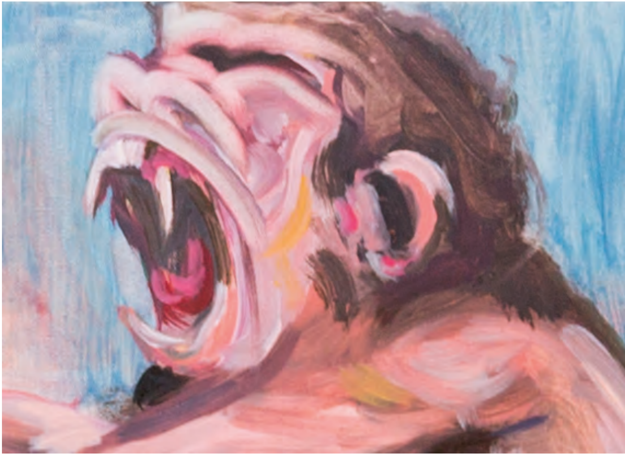
STUDY OF TWO FIGURES IN CONVERSATION detail