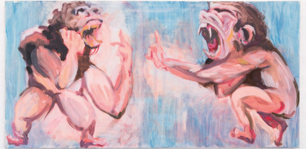
STUDY OF TWO FIGURES IN CONVERSATION 40 x 80 cm oil on canvas