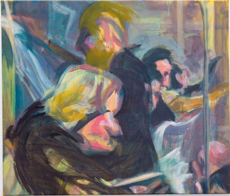
FOUR FIGURES, READING 60 x 70 cm oil on canvas