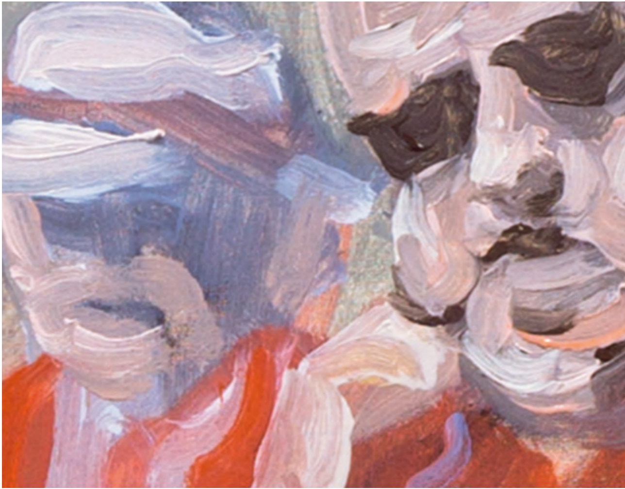
TWO FIGURES IN RED AND BLUE detail