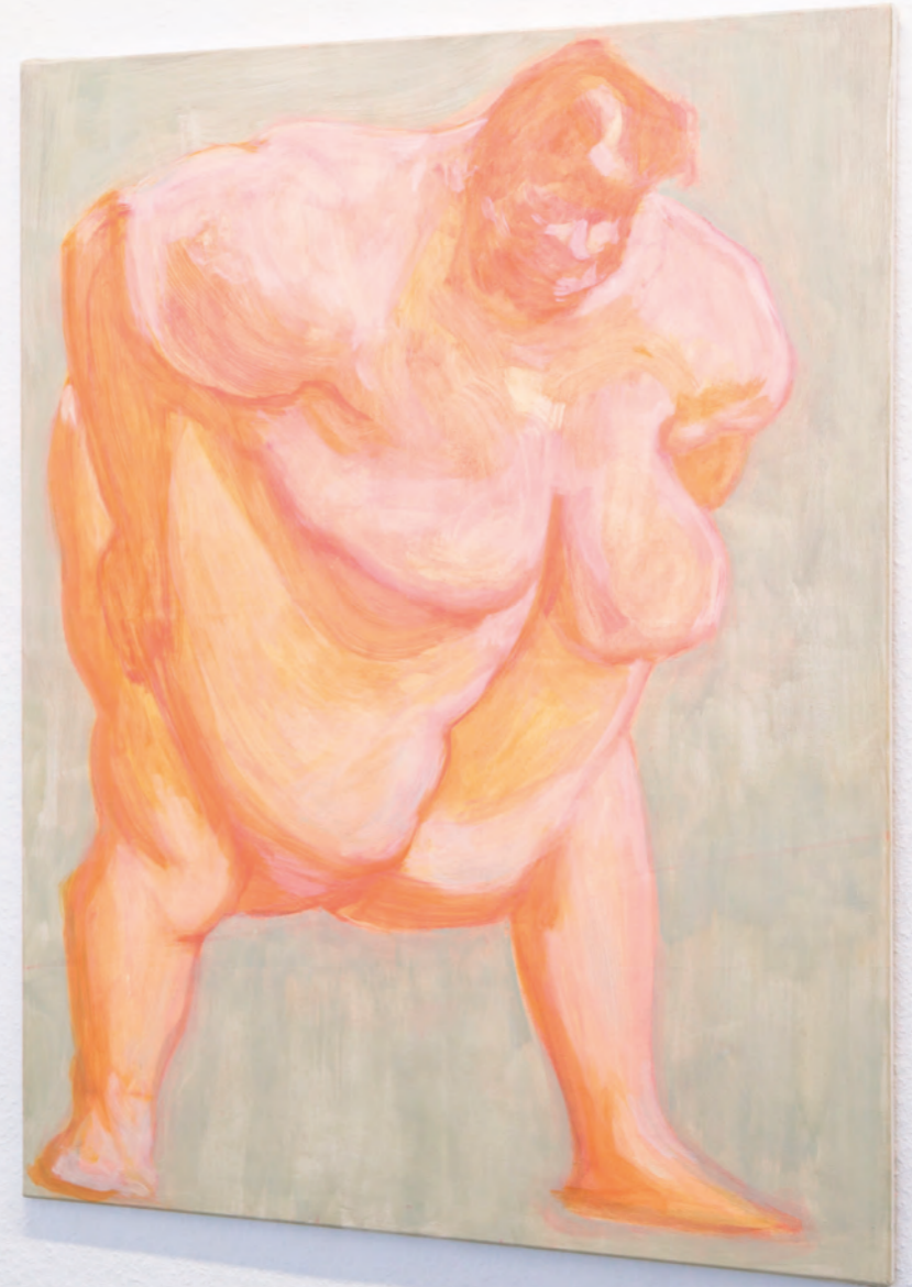
FIGURE, SEATED (left) 40 x 30 cm oil on canvas STUDY FOR THE WISDOM OF SILENUS #1 (right) 120 x 90 cm oil on canvas