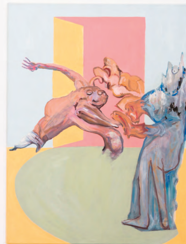
TORMENT OF AGLAUROS (triptych) 3 panels 80 x 60 cm each oil on canvas