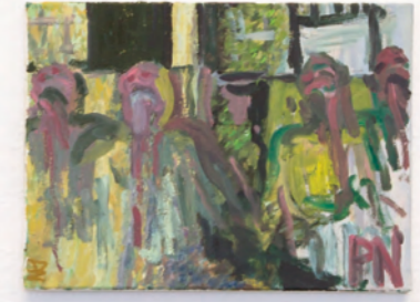
SEATED FIGURES WITH GOAT #1 (left) SEATED FIGURES WITH GOAT #2 (right) each 30 x 40 cm oil on canvas