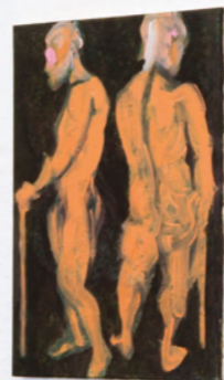
TWO FIGURES (DANTE'S WOOD) 40 x 30 cm oil on canvas