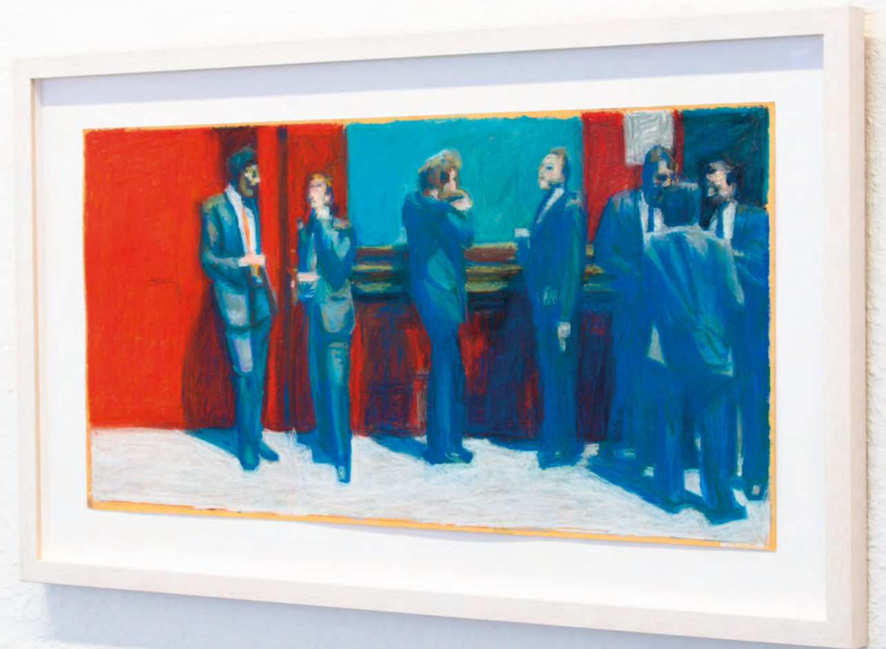
GROUP OF FIGURES 32 x 64 cm pastel on paper