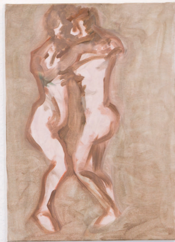
TWO FIGURES ON A GREY BACKGROUND (triptych) 3 panels 70 x 50 cm each oil on canvas