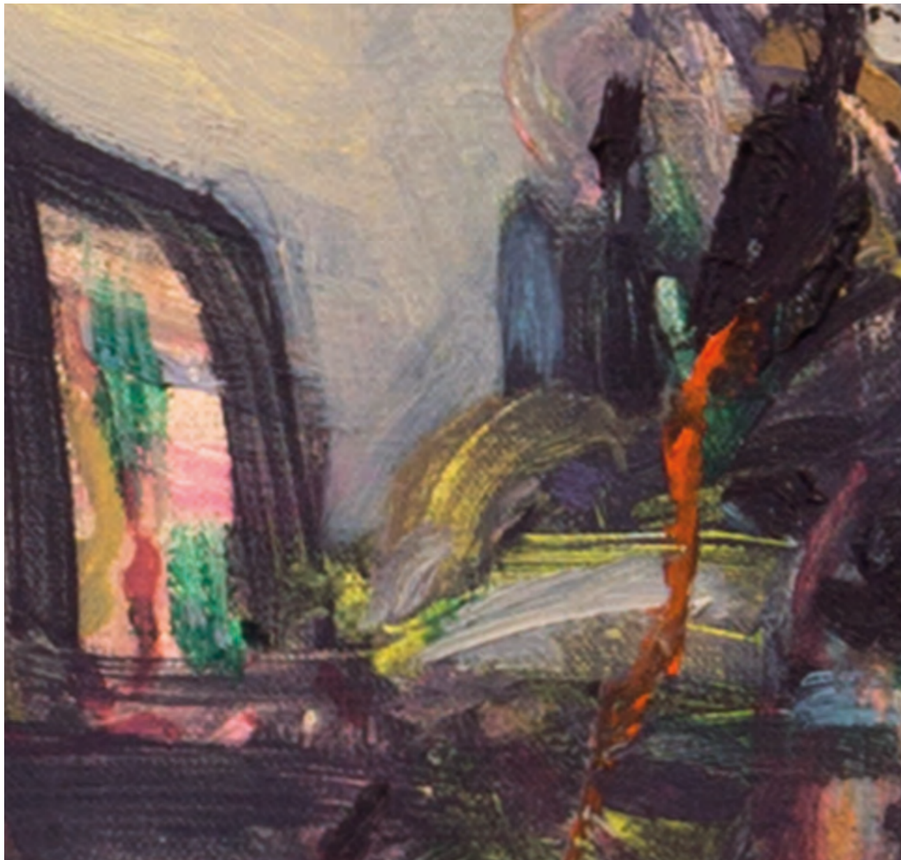
FIGURE, SEATED detail